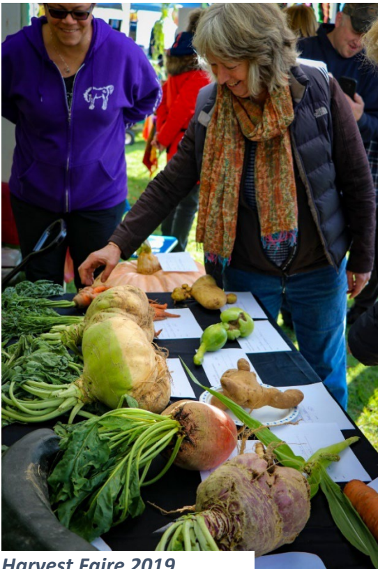
Harvest Faire 2019